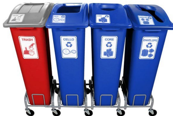
Mobile Manusorter Quad Station with Dolly Custom colors, labels, and signs available

The Bulk Discount Waste Container Experts