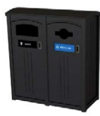
2-Stream- 35 Gallon