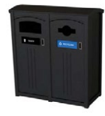
2-Stream- 50 Gallon