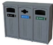
3-Stream- 35 Gallon