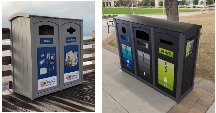
Shown with custom signs